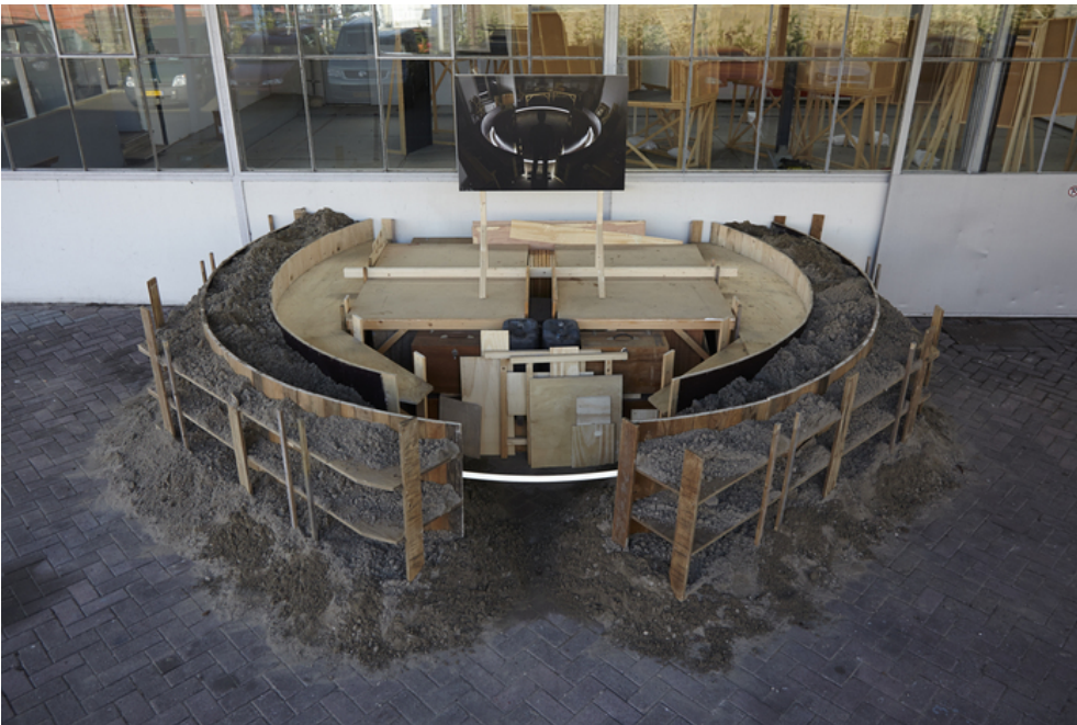
Thijs Ebbe Fokkens, The Meeting of the Eye - a constructed discovery , 2014, Time and site specific installation (wood, sand, neon tubes, photographs), approximately 5 x 5 x 2

m; Photo: Johan Nieuwenhuizen; Courtesy Thijs Ebbe Fokkens